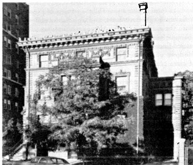
The east side of the house, on Lakeview Avenue, faces Lincoln Park. The porte-cochere appears on the right side of the photograph.

The three-story house is an impressive and sophisticated residence of brick, stone, and terra cotta, with copper and wrought-iron trim. The house is a rectangular block with two projecting two-story bays, one on the east and one on the south side. The bay on the east side has a small open porch on the second floor. Off the southwest corner of the house is a round one-story conservatory. The main entrance is on the south side of the house, under a wide entrance porch at the top of a flight of stairs. Four Ionic columns support the south side of the porch; two piers stand at the east end. (A sun porch with removable windows was built above the entrance porch at a later date.) A large arched porte-cochere is located on the north side of the house. A three-story coach house stands behind the house at the northwest corner of the property.